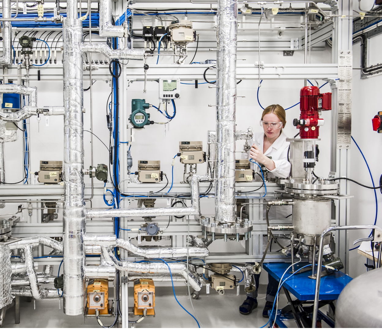
Test and prototype lab at SP Processum, Örnsköldsvik.

collaborate in interdisciplinary projects. New technology, sustainable business models and innovative capacity is developed in constellations based on people's diversity, skills and ability to work together.