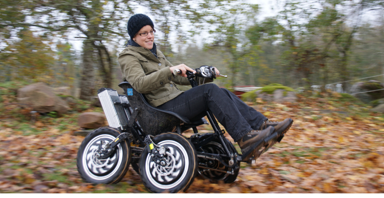
A 4wd electric all terrain vehicle from Zoomability AB.

vision; to become an internationally acclaimed innovation environment enabling commercial success of new robot solutions.