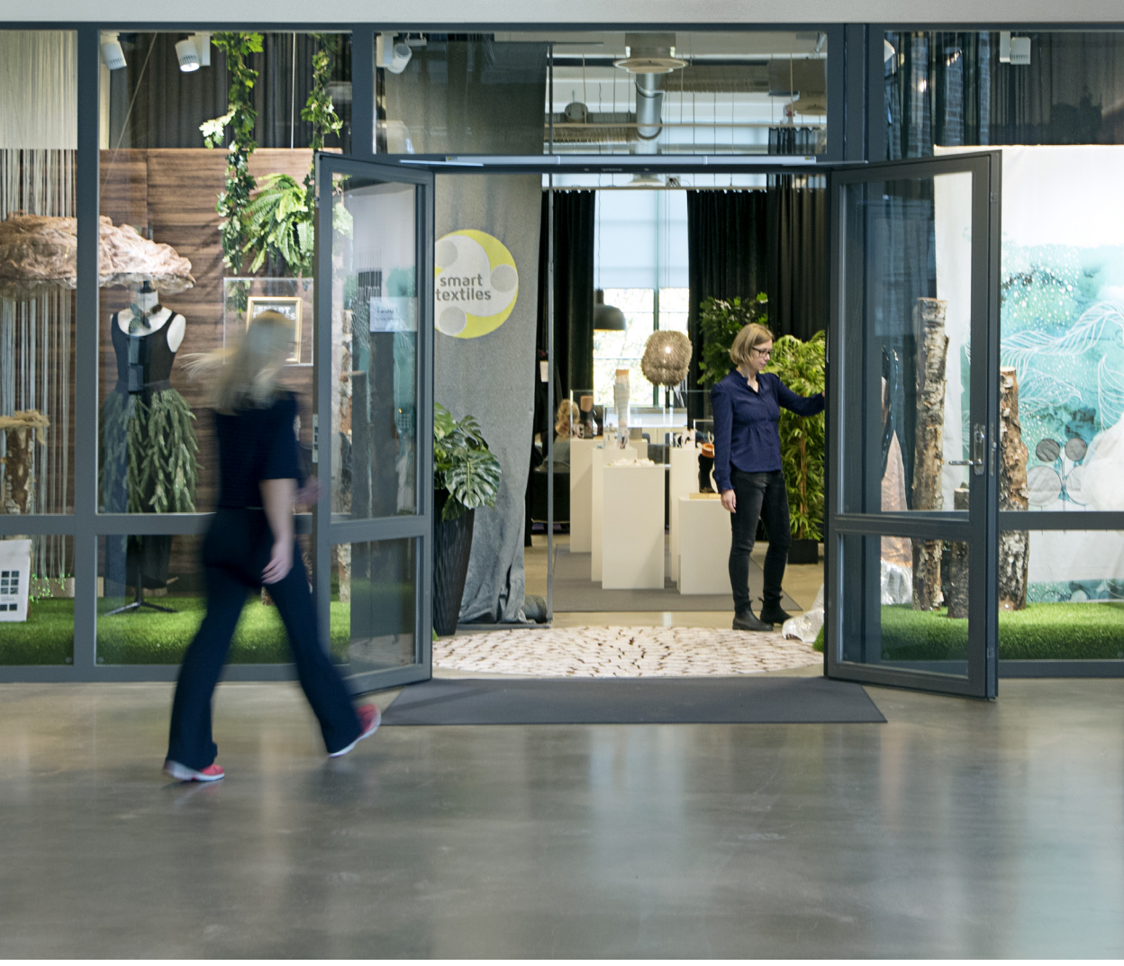
In Smart Textiles showroom prototypes from various projects are displayed.