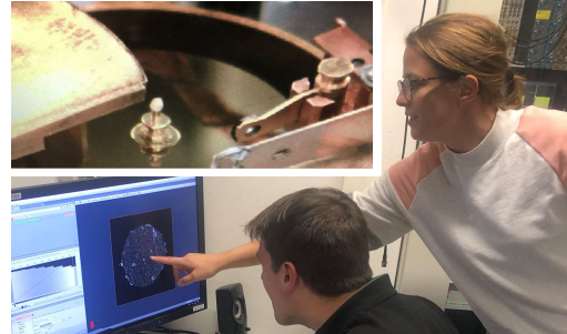
Figure 1. Top. Sample in place for ptychographic tomography. Bottom: On-line reconstruction of the data.

drugs and polymers with different drug contents and with two different processing methods, extrusion and solvent casting, were prepared and evaluated.