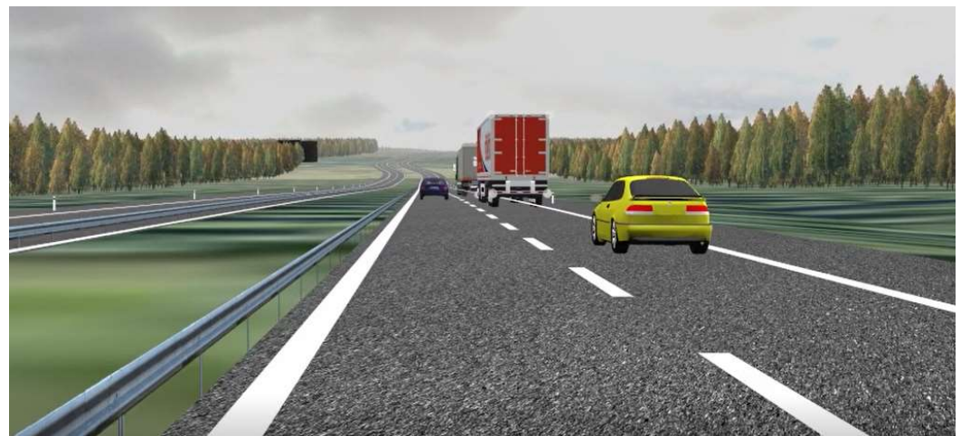
Figure 3: Representation in driving simulator of scenario with truck changing lanes.

were instructed to drive in the left lane (see Figure 3 for a representation of the participant's view).