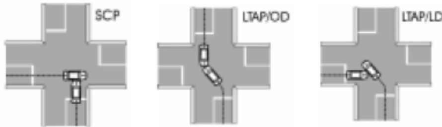
Figure 1: Three intersection crash types making up for more than 75% of intersection crashes (Najm et al. 2001).

Countermeasures addressing intersection crashes have traditionally been intersection design and passive safety measures. During the last 10 years, significant progress in sensing and other technologies has enabled new opportunities for Advanced Driver Assistance System (ADAS) in intersections – aiming at mitigating or avoiding intersection crashes by using in-vehicle technology. The projects INTERSAFE and INTERSAFE2 (Intersafe-Consortium 2008, Intersafe2-Consortium 2011) focused on technology development and functionality testing. There are also advances in infrastructure design, such as the roundabout deployment in Sweden, but these design approaches may not be suitable in all contexts and all countries. ADASs have a huge potential in reducing the number of intersection crashes, or mitigating their consequences. The ADASs may either be in-vehicle, cooperative by including communication between vehicles, or between infrastructure and vehicle. So far, the focus from an ADAS perspective has primarily been on technology, while there is limited knowledge about driver behavior and actions when entering and negotiating intersections in normal driving as well as in critical situations preceding crashes. Further understanding in these areas is crucial for the design and implementation of intersection ADASs, both from the perspective of system effectiveness at reducing harm and of system acceptance by drivers.