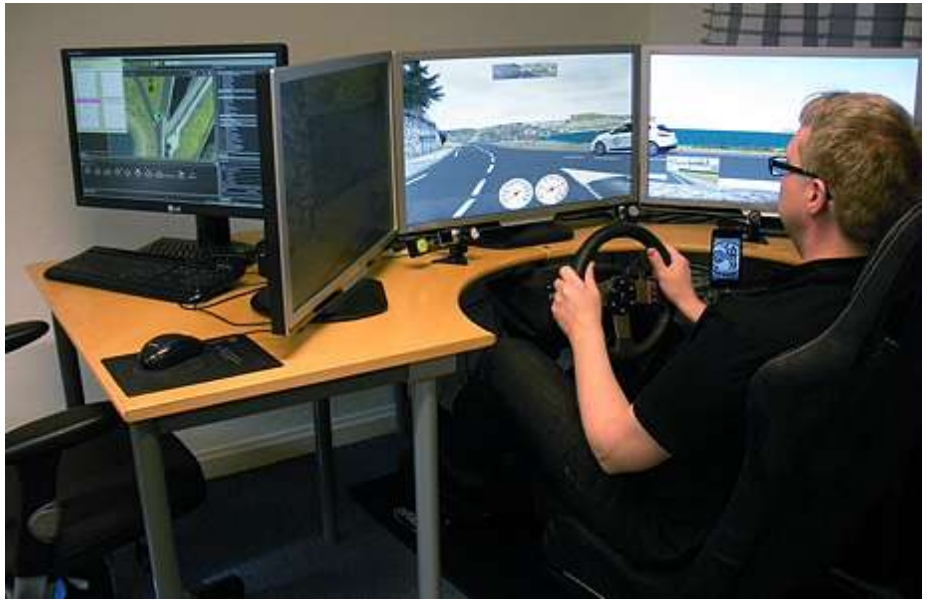
Figure 1: SIMSI test environment in action

driver's seat. These are used mainly to control the driving simulator, but there are also a number of buttons on the steering wheel which are used to browse the menus in the HMI and as Push-to-talk (PTT). An Android tablet showing the HMI GUI is placed in front of the user, trying to match the position of a display in a car. Both TDM and Populus run on the same desktop computer as the driving simulator, and a Populus Android app runs on the tablet. The app allows the user to select items by tapping them, as well as scrolling in lists in normal smart phone fashion. The eye tracker runs on a separate desktop computer, as it requires a substantial amount of processing power.