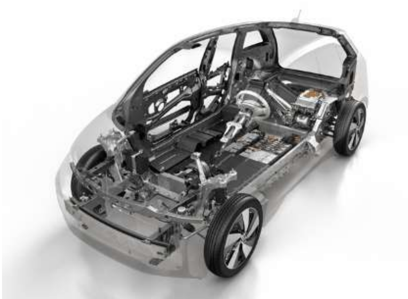
Fig. 1 Cross-section of the BMW i3 with a complete composite cabin

Another trend in the automotive industry is the individualization and customization of vehicles to individual customers. This means that the body of the vehicle will be standardized around the high volumes, and that the customization will be by means of a small series of customized components.