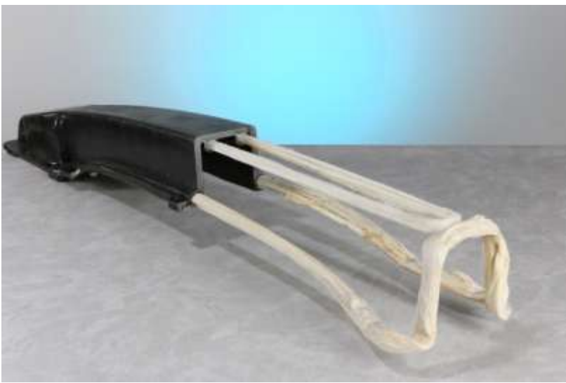
Fig 2. The bumper beam of X-TECH <sup>TM</sup> for cars

TECH <sup>™</sup> X-thus combining the benefits of properly positioned reinforcing elements usually used for low volume production by over molding process for high volumes. The high utilization of the material properties in combination with the efficient production provides components with the potential for both weight and cost. INXIDE created in Switzerland in 2008 to launch the X-TECH <sup>™</sup> and 2011 Fouriertransform invested in INXIDE to industrialize the technology. The company has a number of successful pre-development project demonstrated the cost-effective weight saving of up to 50% of the load and the energy-absorbing components! Among other things, received INXIDE with Hyundai Kia and Hanwha L & C the prestigious JEC Innovation Award 2013 for a bumper beam of X-TECH <sup>™</sup> that was 30% lighter than comparable GMT solution (Fig. 2).