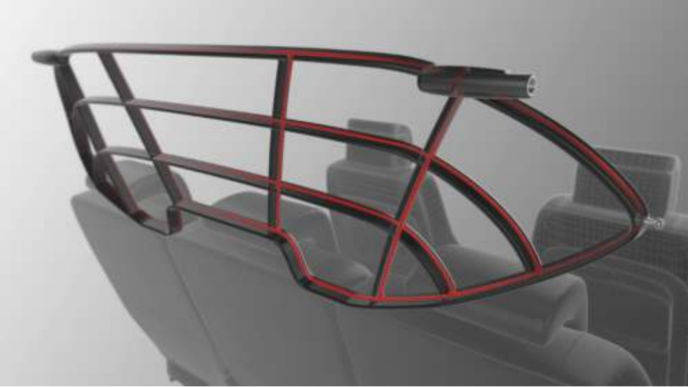
Fig. 4. The cargo barrier developed within the project

The developed design was produced in a small series. Articles produced was used for static and dynamic testing. The dynamic test was done by crash tests on Klippan Safety's own test facility. The impact test showed that the design and concept partly capable collision requirement and partly to the material models that are created have a high degree of regularity to the practical test.