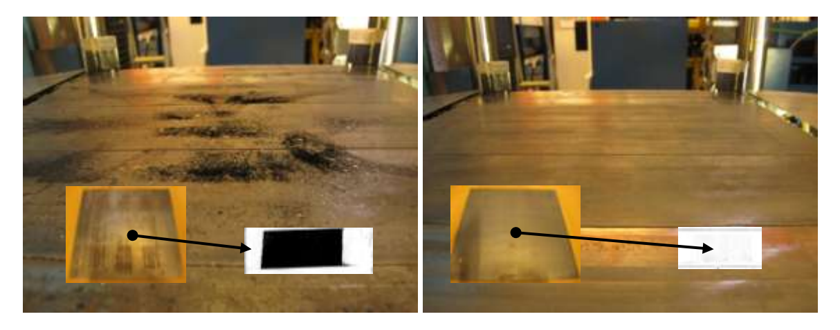
Figure 3. Hot stamping of non-pretreated reference material (left) as well as pre-treated material (right), the oxides showing very poor and excellent adhesion, respectively. The images show the tool surface after hot stamping and the amount of oxide that has flaked off from the blanks, as well as the produced blanks and the tape tests.

The performed research has resulted in an increased understanding to why the process improves the oxide adhesion, and the process parameters have been related to the properties of the produced oxide. The pre-treatment has been made more effective, and the process window has been narrowed down. However, this process window is affected by small variations in the incoming cold-rolled material, which has made implementation more difficult than expected. The acquired knowledge is however anticipated to enable the development of a stable process where subsequent shot-blasting is eliminated.