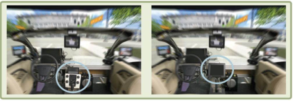
Examples of infotainment system installations

Due to the need of flexibility and rapid simulations, a fixed base driving simulator construction was preferred. The Norwegian company AutoSim was chosen because of the simulator's flexibility and ease of use. The company provides high quality visual driving terrains and a wide range of driving scenarios, with graphical user interfaces for easy scenario programming.