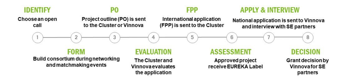
Figure 1. The proposal for Eureka-cluster projects takes place in several steps.

A proposal for a Eureka-cluster takes place in several steps, see Figure 1. Within the clusters, project calls are organized, usually in two steps, and these are published at the cluster's respective websites. Sometimes so-called cluster-wide calls are made, and then the application and assessment process may look different.