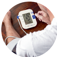
Health and healthcare

New knowledge and competence are necessary to create the innovations of the future. Therefore, we conduct knowledge and competence programmes that benefit our community. At present, VINNOVA focuses on the following fields: