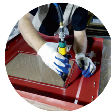
Manufacturing and Innovation Management