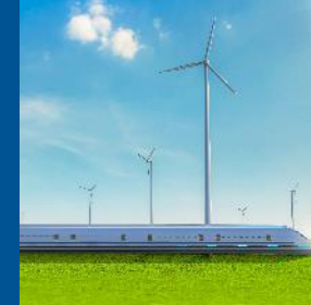
Climate, Energy and Mobility