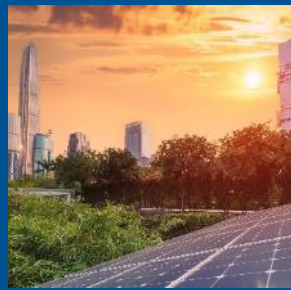
Destination 2 Cross-sectoral solutions for the climate transition