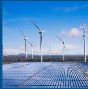
Destination 3 Sustainable, secure and competitive energy supply