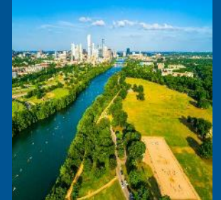
Food, Bioeconomy, Natural Resources, Agriculture and Environment