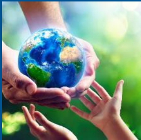
Destination 1 Climate sciences and responses

Accelerating green and digital transformation of economy, industry and society achieving climate neutrality in Europe by 2050