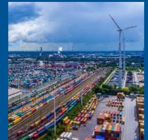
Destination 6 Safe Resilient Transport and Smart Mobility services for passengers and goods