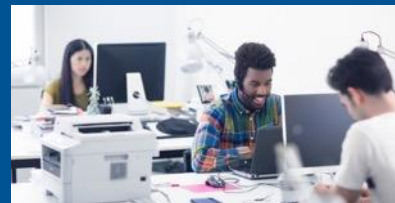
Joint Research Centre