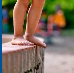
Civil Security for Society