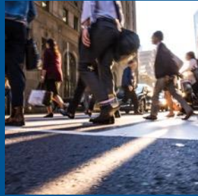
Culture, Creativity and Inclusive Society