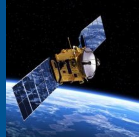
Digital, Industry and Space