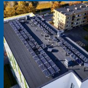
Destination 4 Efficient, sustainable and inclusive energy use